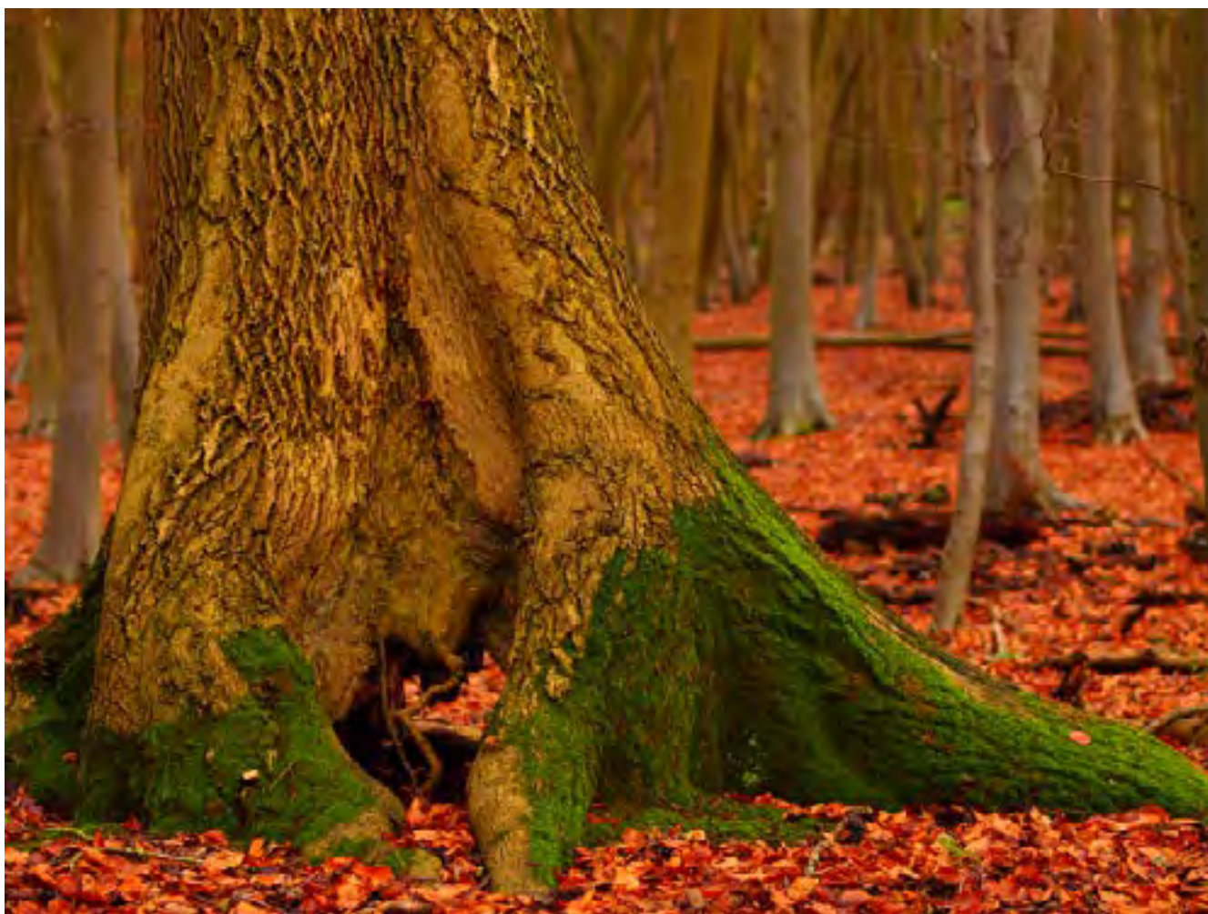
Autumn at Wytham Woods

Light, airy, detached, modern 3-bedroom sunny house for sale in lovely village: Wolvercote, Oxford. Garage, carport, garden, off road parking. Fantastic position: 4-min walk from Port Meadow, within ring road and walking distance to Oxford city centre. Corran House is a warm, much-loved, convenient home with luxury Harvey Jones kitchen, an open-plan triple-aspect reception room, fitted carpets in excellent condition, large modern bathroom with double sink, bath and shower. Patio doors overlook a colourful landscaped garden with log cabin. Close to beautiful Port Meadow and river with fabulous walks and bird life. Ready to move into. Wolvercote village is part of Oxford city while simultaneously offering a rural landscape. Regular frequent bus service; friendly community; 3 pubs; 2 churches; shop; village hall. Nearby petrol station. £925,000. For further details, information on open days and to view please email: wolvercotehouse@gmail.com with name, telephone number, and buying position.