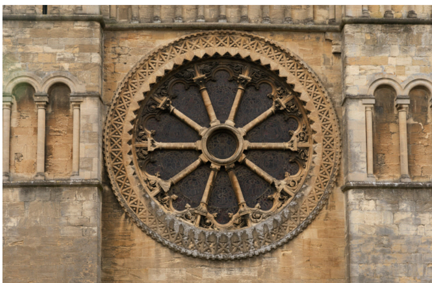
Christ Church Cathedral

Schola Cantorum of Oxford will give a recital at 2.30pm on 19 November in the de Jager Auditorium. Booking required; more information: www.trinity.ox.ac.uk/events-at-trinity .