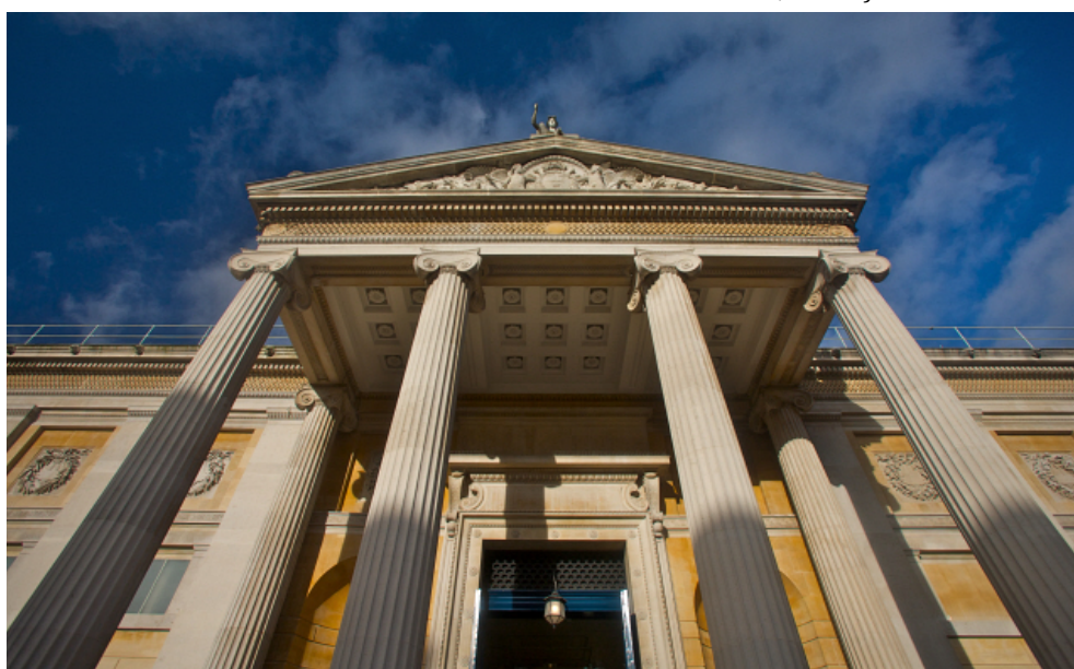
Ashmolean Museum