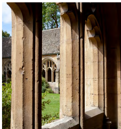
New College cloisters

2 These changes to regulations shall be effective from the date on which the Statute approved by Congregation is approved by His Majesty in Council.