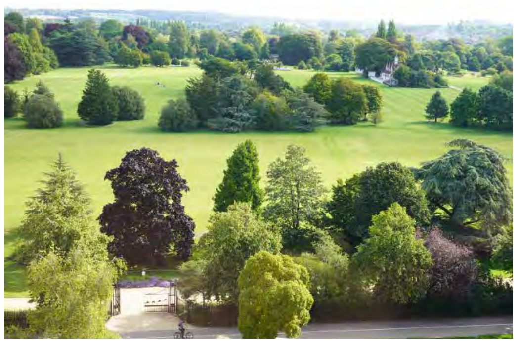
View over University Parks

Subject : 'The Argonauts and their search for the Golden Fleece myth'