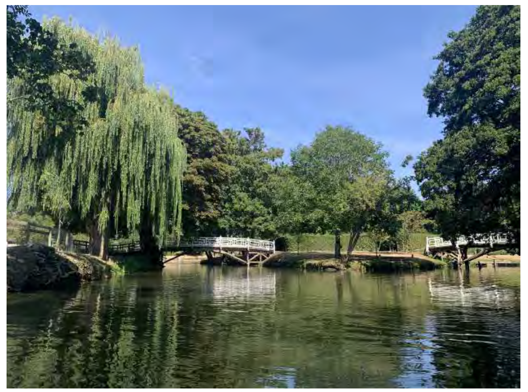
Bridges on the River Cherwell

Lovely light-filled detached house in Wolvercote, Oxford, within walking distance of Oxford University, on a bus route. 3 bedrooms; south-facing garden with summerhouse. Offstreet parking for several cars; garage; carport. Harvey Jones kitchen with all mod cons; luxurious bathroom. Wolvercote has a friendly community with churches, village hall, shop, pubs, beautiful Port Meadow, river and nature on the doorstep, while part of Oxford city. £875,000. For information email wolvercotehouse@gmail.com.